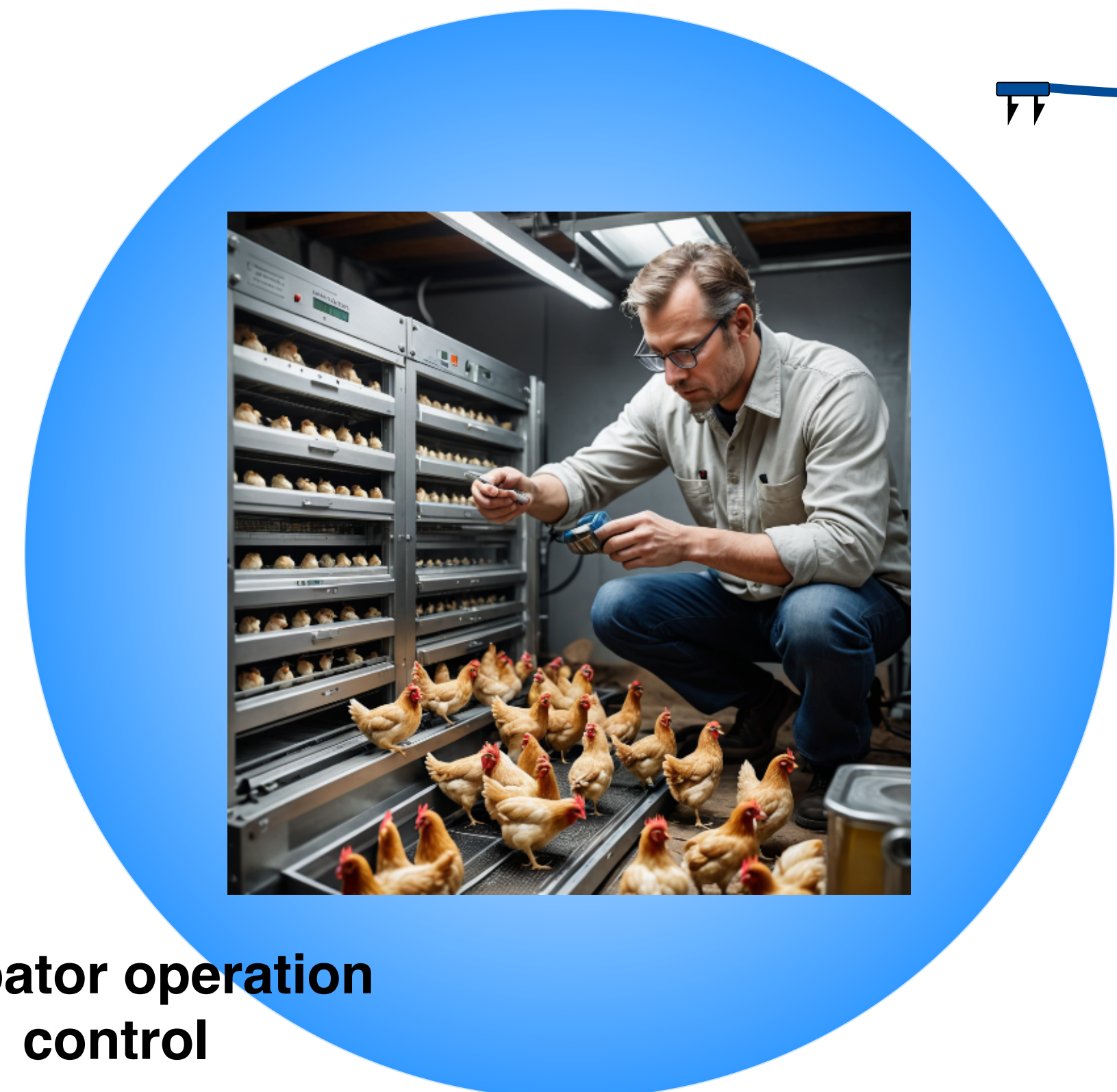
Incubator operation control