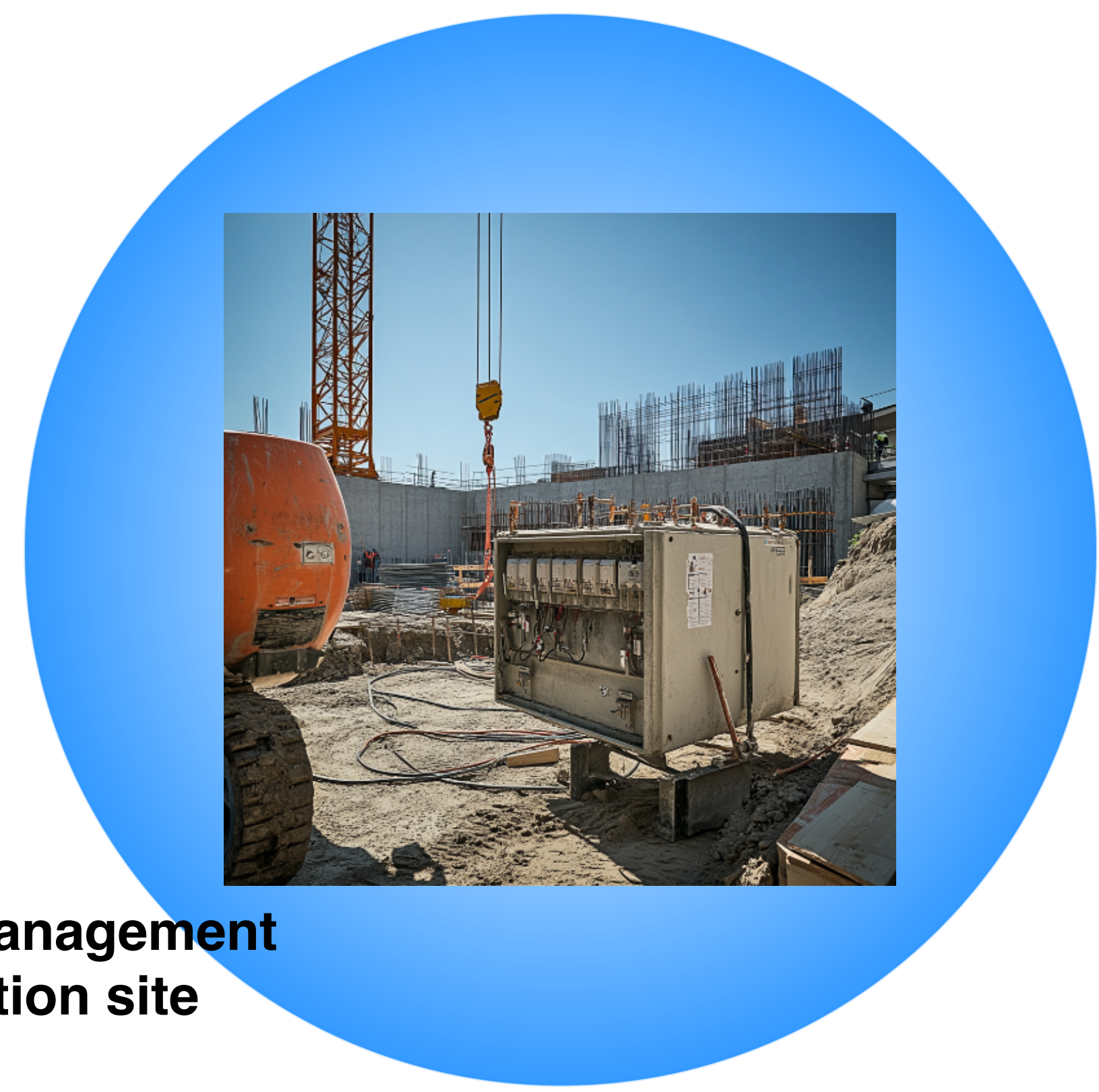
Power supply management at a construction site